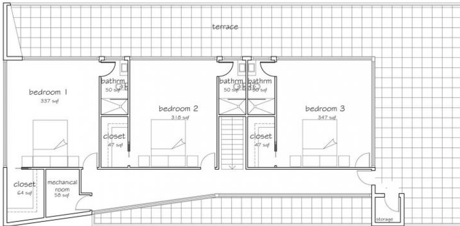
1er étage/1st floor: 1,920 pi/sf